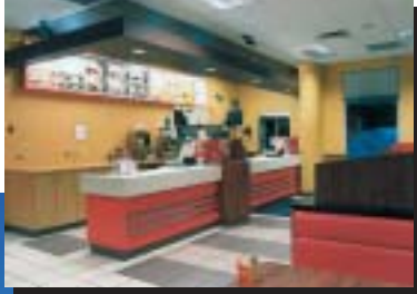
FULL A&W RESTAURANT